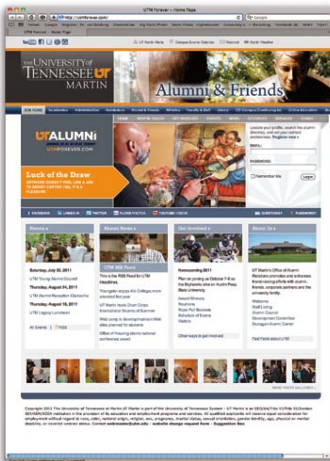
The redesigned UT Martin alumni website, www.utmforever.com , allows alumni to stay connected in more ways.

"This is the future," Deal said. "This is an exciting and dramatic change that will deliver what UT Martin alums want—access to a connected community of more than 325,000 UT alumni around the world." To add your email address to the current database, visit utmforever.com , and sign up today.